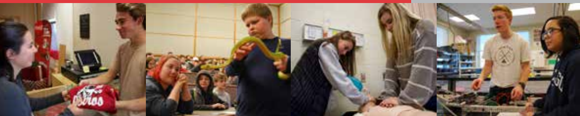
BUSINESS SCIENCE/MATH TECHNOLOGY MEDICAL ENGINEERING